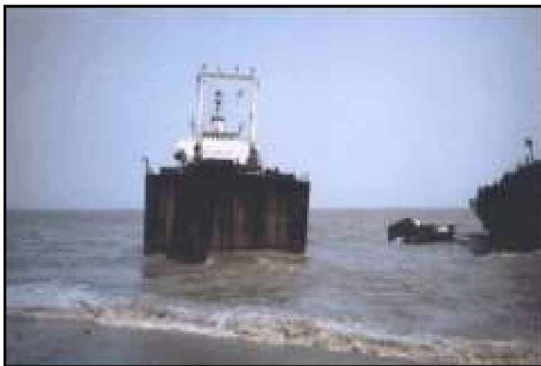
Welcome to Alang, where old ships go to die.

Somewhere off the coast of India tonight, a small flotilla of doomed ships waits for high tide. From the shore, their forms are silhouetted on the horizon by the moonlight: a super-tanker, warship, car-ferry--nearly 20 in all. They have come from every corner of the world to this spot. In the morning light, they will fire their engines for the last time, and hurl themselves onto the beach.