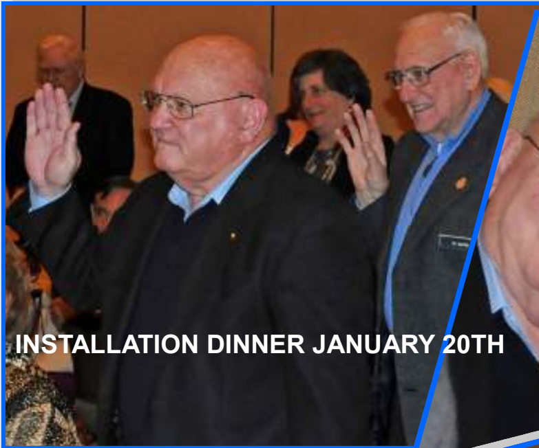
INSTALLATION DINNER JANUARY 20TH