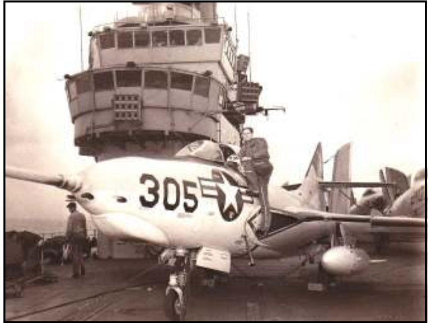
Author mounting his F9F-8 Cougar on flight deck USS RANDOLF 1956

This was my first Six Fleet cruise in the sunny Mediterranean. During this deployment RANDOLPH was engaged in " Operation Watch and Wait " which centered primarily in and around 'Point Moses". This point on the charts at Latitude 35 North and Longitude 19 East, some 181 miles southeast of Malta was our operating area for an entire month. It was here that a great part of the Sixth fleet watched and waited for results of the Egyptian-Israeli conflict. Our squadron provided day and night CAP for the U.S. fleet as well as support for the Marines evacuating U.S. Nationals from Alexandria and Cairo.