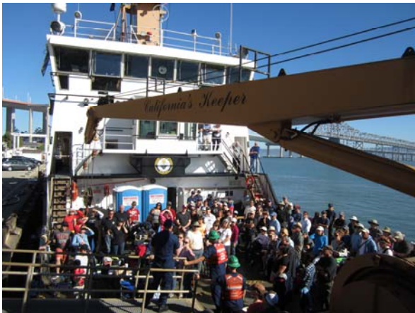
People boarding the George COBB buoy tender.