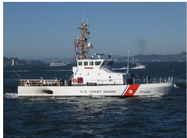
U.S. Coast Guard boat patrolling the waters.