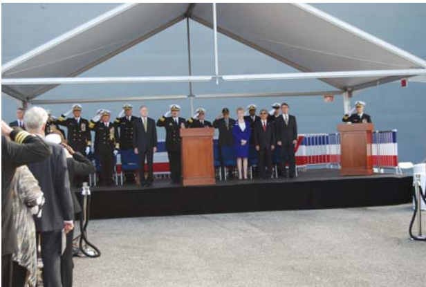
Picture is of podium with dignitaries for ceremony.