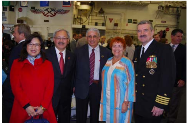
San Francisco Mayor, Edwin M. Lee.