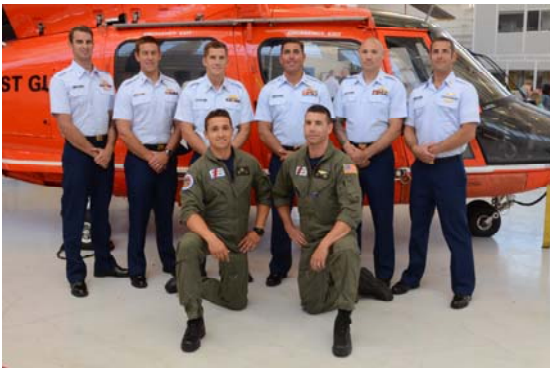
Team Members—USCG Air Station SF.