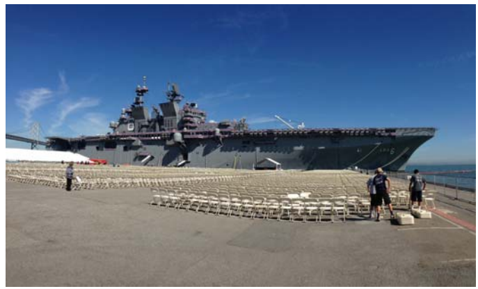
USS Americas commissioning housed over 10,000 attendees.